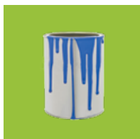
Construction and demolition waste (make sure it's easy and safe to transport)