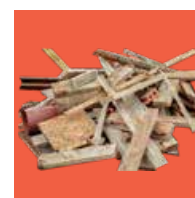
Waste not sorted by type of material