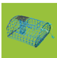
Marine debris (limit of 5 traps and 10 buoys per resident)