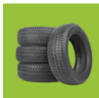
Tires (limit of 8 per resident)