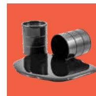
Commercial waste (Residential waste only)