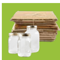
Glass & Cardboard (this material will be recycled)