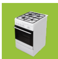
Appliances and furniture