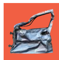
Auto parts (except tires)