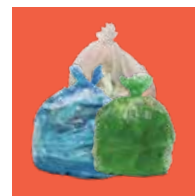
Regular waste eligible for roadside pick-up (blue, green and clear bags)