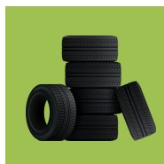
Tires (limit of 8 per resident)