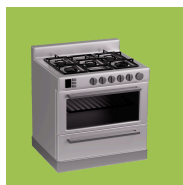
Appliances and furniture