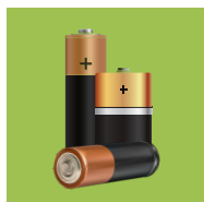
Household hazardous waste