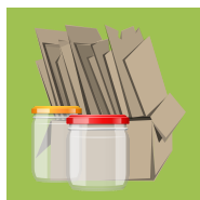
Glass & Cardboard (this material will be recycled)