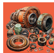
Auto parts (except tires)