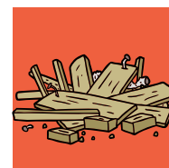
Waste not sorted by type of material