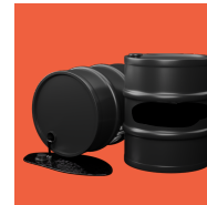
Commercial waste (residential waste only)