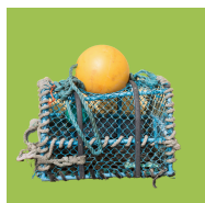
Marine debris (limit of 5 traps and 10 buoys per resident)